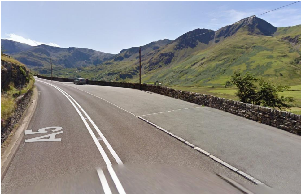
Car parking in layby on the A5 just south of Ty Gwyn