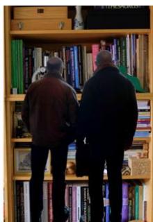
Want to borrow a book? (Society members only)

At present our library is without a permanent home. It resides in a set of boxes for safe storage. The Honorary Librarian has catalogued the collection and a preliminary catalogue and booking form is available on the LGS website: https://liverpoolgeologicalsociety.org/library-booking