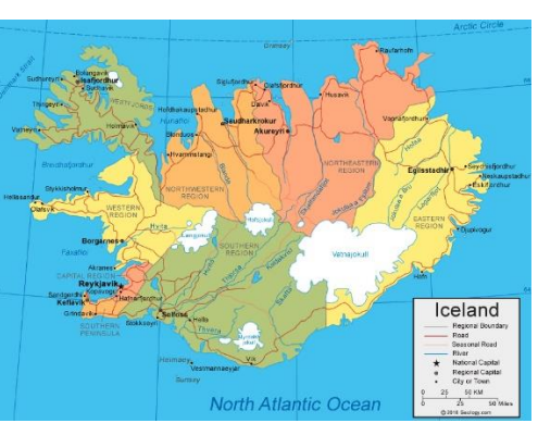
Þingmúli central volcano is an extensively eroded Miocene (~9.5 Ma) volcanic edifice in the East Fjords, Iceland.

In this presentation, the physical volcanology and volcanic evolution of the Þingmúli edifice is explored, using the characteristics of its lavas, morphology, and alteration products. The presentation will also outline volcanism in Iceland, and how volcanic histories from ancient volcanoes can be applied to its modernday volcanism.